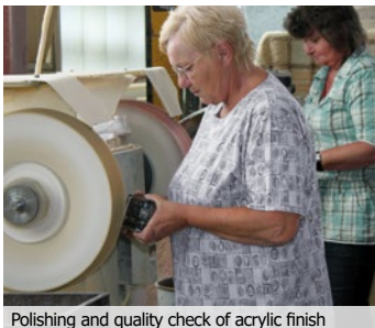
Polishing and quality check of acrylic finish