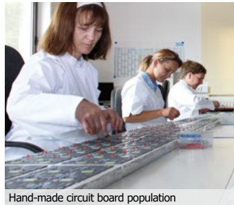
Hand-made circuit board population