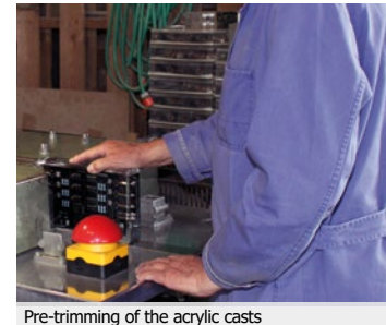
Pre-trimming of the acrylic casts