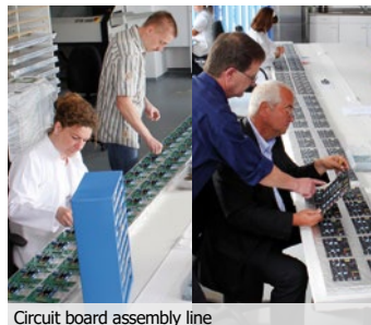
Circuit board assembly line