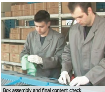
Box assembly and final content check