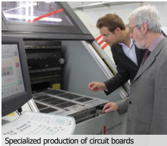
Specialized production of circuit boards